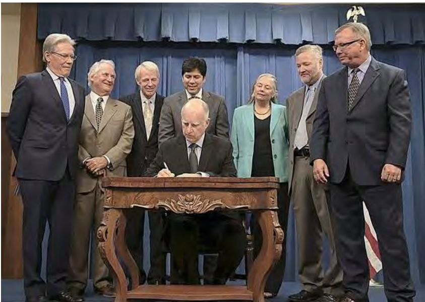
California Gov. Jerry Brown, seated, signs a package of groundwater bills Sept. 16. The legislation gives the state broad controls over groundwater use.

Gov. Jerry Brown has signed a package of legislation giving the state sweeping new controls over groundwater use in California. The bills set deadlines for establishing and implementing management plans in various groundwater basins.